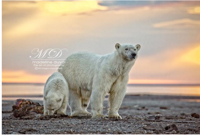
Photo Caption: Awarded Best in Show; Searching for Sea Ice (Nature)